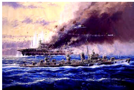
Death throes of USS Hornet